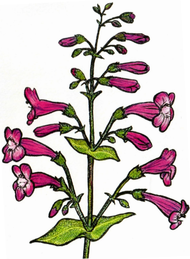
Canyon Penstemon, Penstemon pseudospectabilis