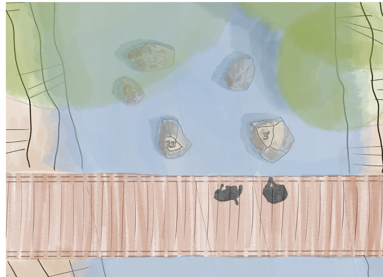
Concept Sketch—Wet Conditions