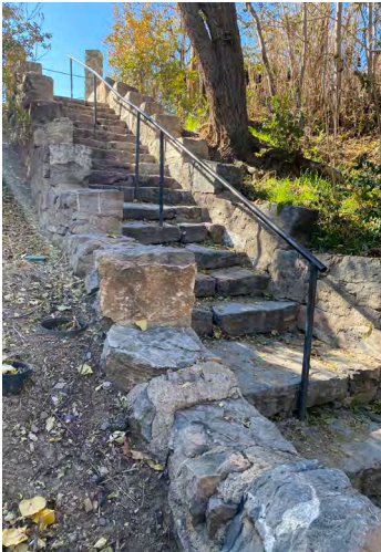
Stone staircase at Big Ditch Park in Silver City, NM