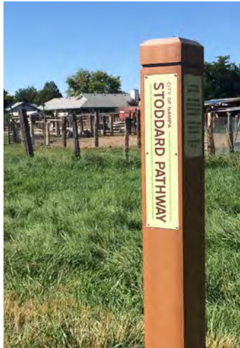
Example trail marker