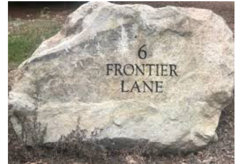
Example engraved boulder