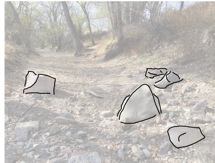
Existing boulders (2022)

This cluster also provides informal seating and gross-motor play when the creek is dry. Additional boulders could be added to expand the amount of seating and provide a greater variety of heights to mark.