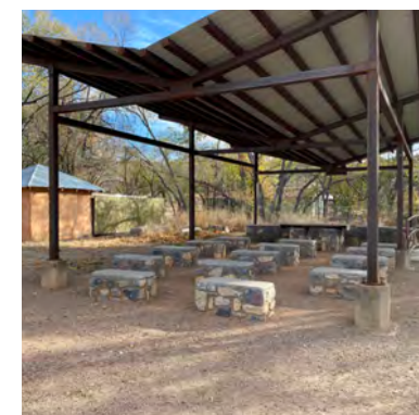
Existing Pavilion (2022)