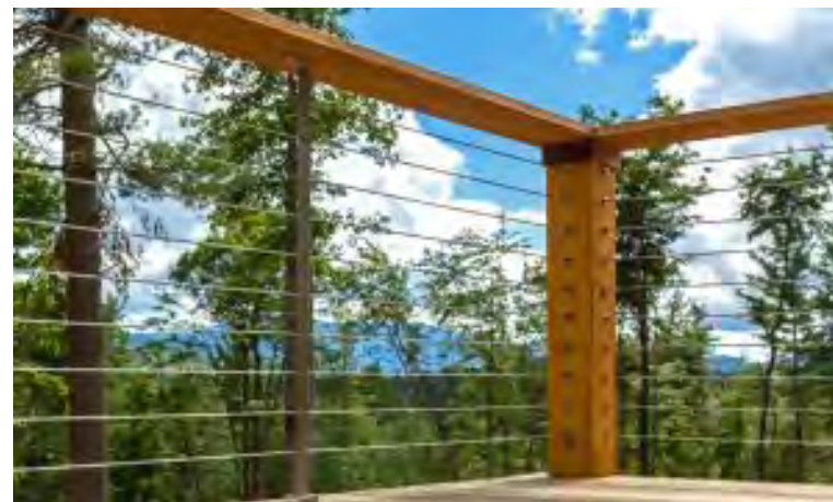
#6: Example guard rail