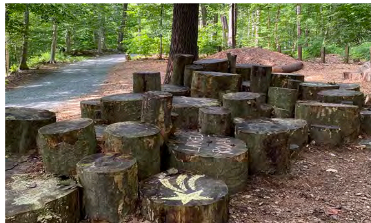
#5: Example of trunk mound (Garden in the Woods, MA)