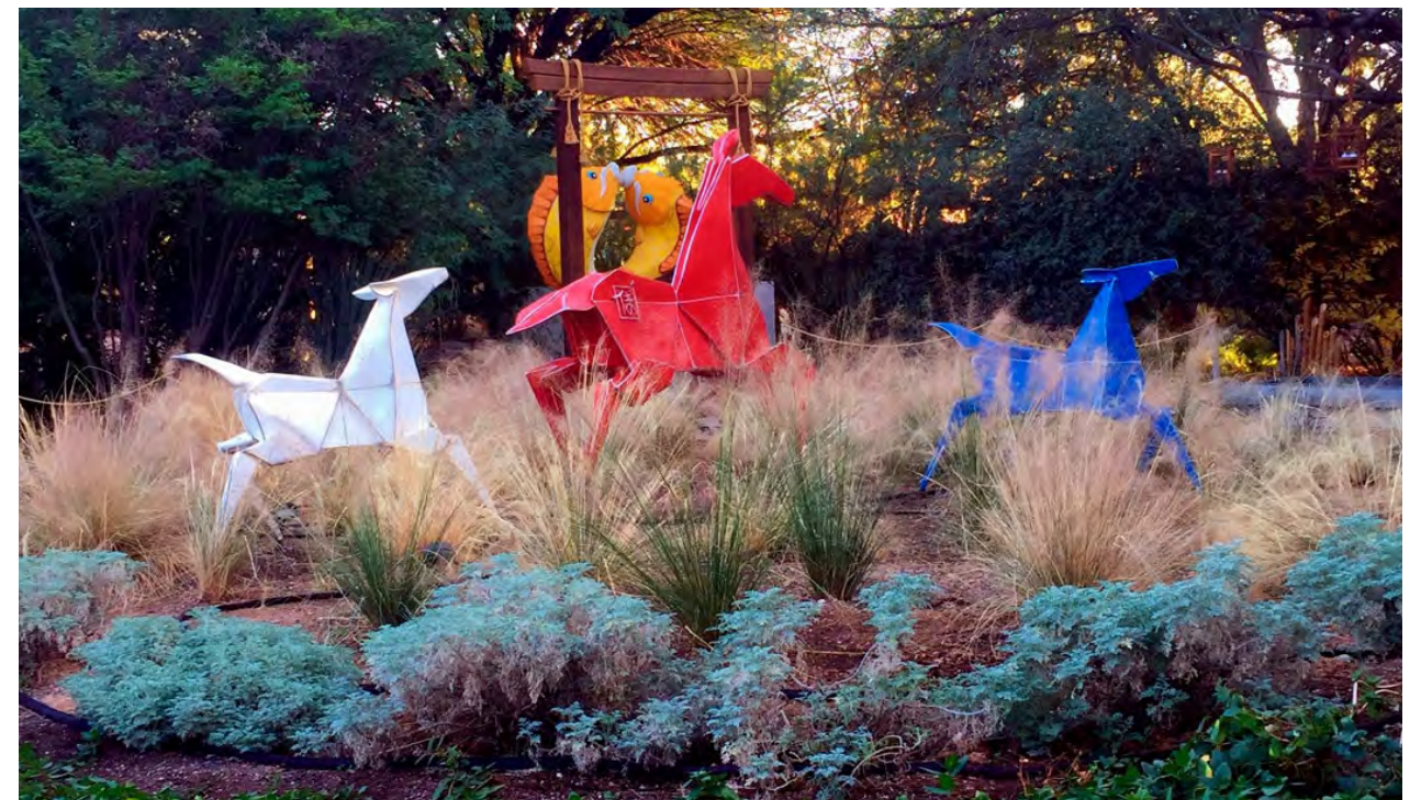
Tucson Botanical Gardens