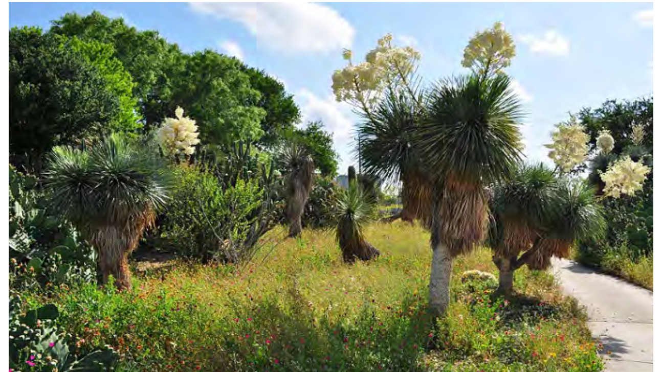
Santa Fe Botanical Gardens