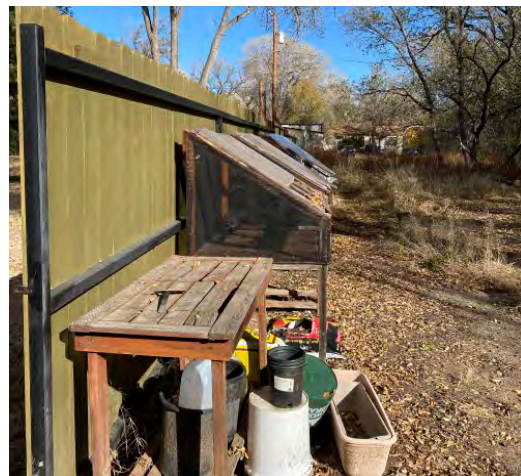
Gardening supplies along inside of fence

Currently, a gravel service road runs along the west edge of the fence and a turn-around juts into the center of the garden. The road is not used often but is very handy when large trucks need access to the garden. This road is also used commonly by children in the neighborhood. It would improve the guest experience and safety of visitors to provide a sheltered path, as opposed to a shared path, for pedestrians.