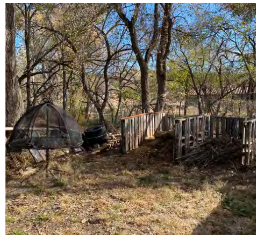
Composting system and misc. storage