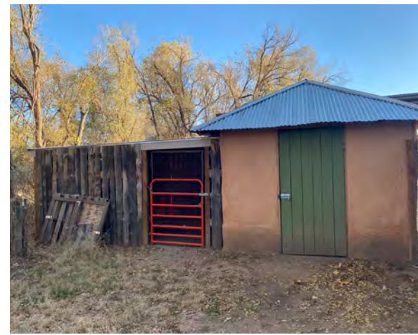
Adobe tool shed and extension shed