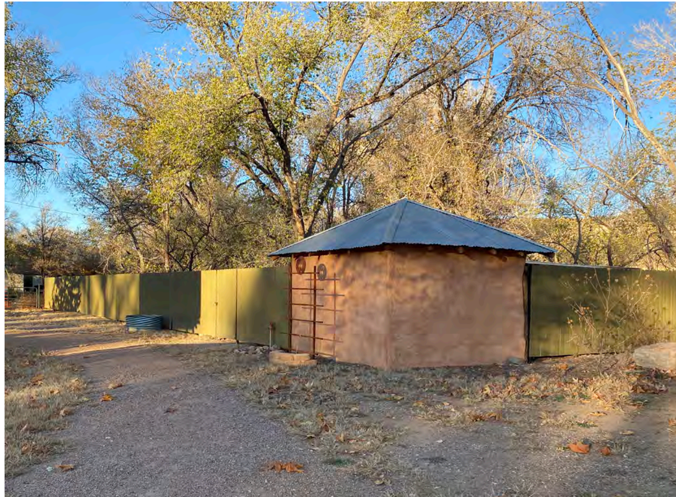
View of shed and fence from within garden

A significantly large storage area on the east edge of the property is equipped with an adobe storage shed, a gated extension tool shed, composting station, planting benches, and room to temporarily store materials. The service area is locked, and volunteers only have access to this during scheduled workdays.