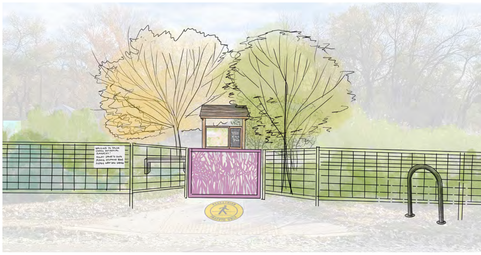
Sketch of Recommended Additions