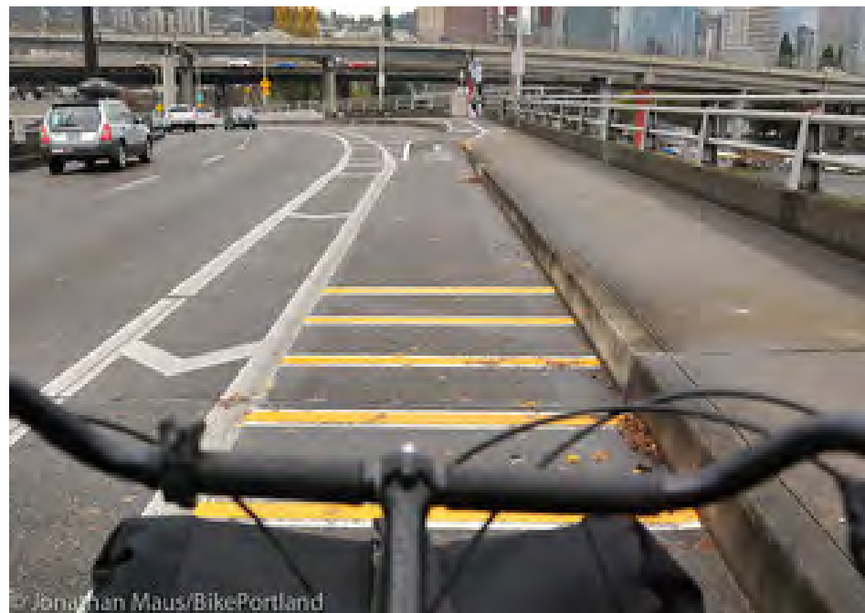
Example of series of small speed bumps