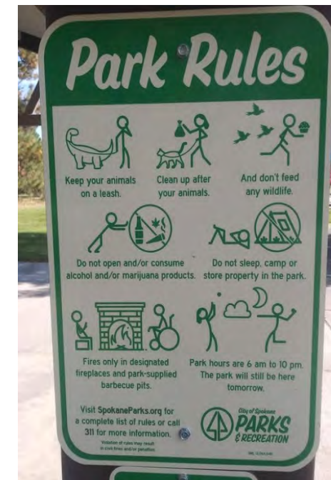
Example of friendly park rules sign