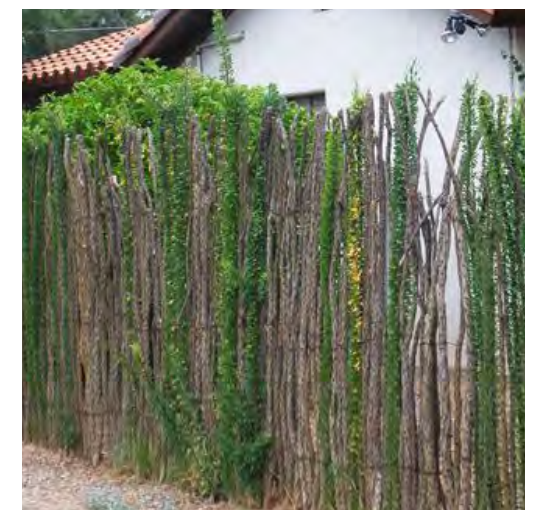
#4 Example: Ocotillo, reed, or other natural material