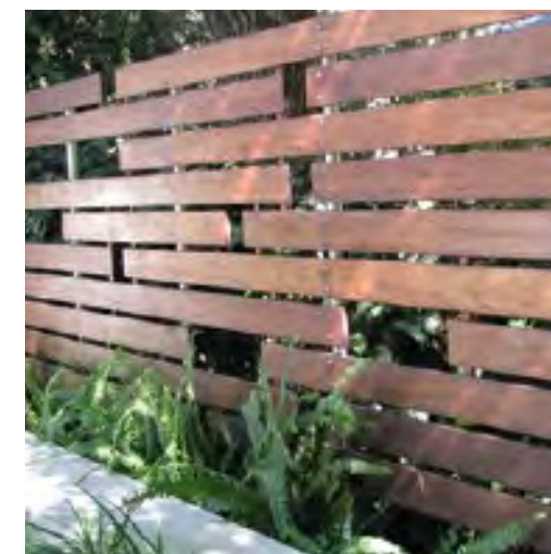
#4 Example: Irregular wood slats