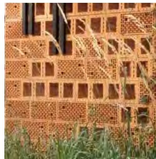
#4 Example: Block wall with irregular openings